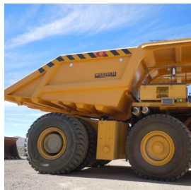
Off-highway dump truck bodies