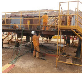
On-site maintenance and shutdown services (Austin Engineering Site Services)