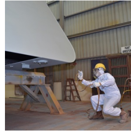
Painting and blasting