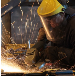
Equipment repair and maintenance