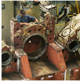
Specialised machining and line boring